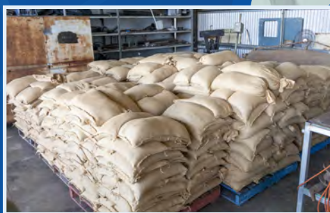
QCS disaster readiness in full swing Page 11