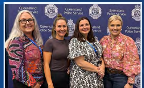
QCS women shine in AIPM QBalance program Page 17