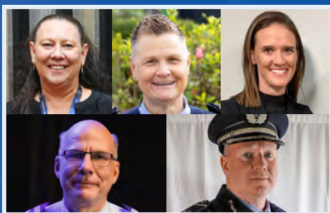
Six officers named in Australia Day Honours list Page 9